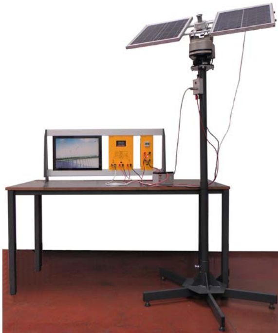
DL SUN-TRACKER (bench not included)

For the study of the operation of a solar panel that follows the sun light direction thanks to a motor system.