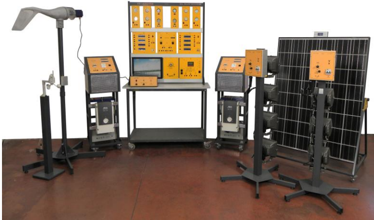
DL SUN-WIND24V and DL SUN-WIND12V

The main target of a hybrid power system is to combine multiple sources to deliver non-intermittent electric power, trying to take advantage of multiple available renewable energies.